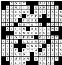
Last Saturday's Puzzle Solved